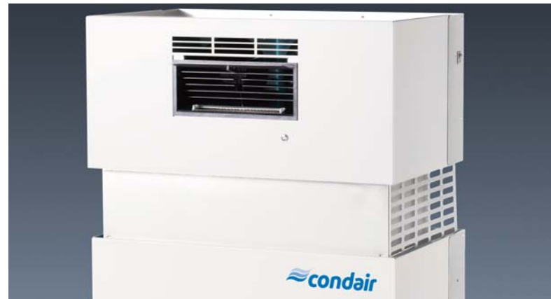
Condair CP3 steam humidifier