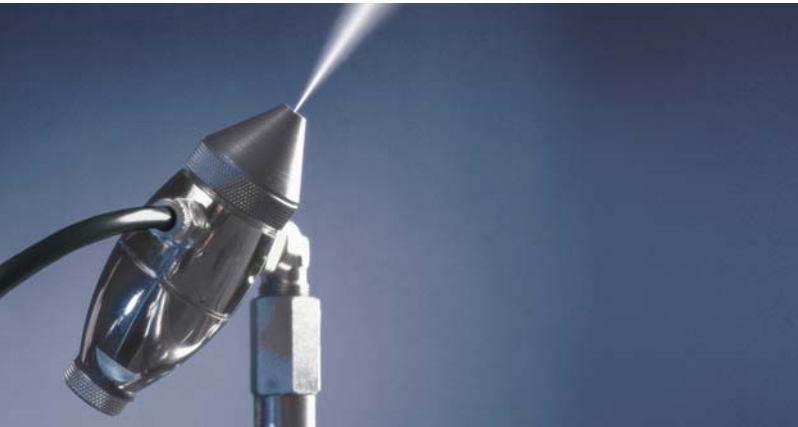
JetSpray compressed air & water humidifier