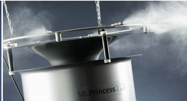
ML Princess high pressure humidifier